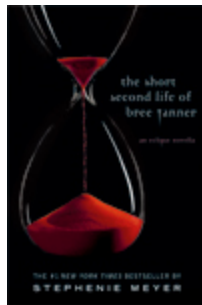
The Short Second Life of Bree Tanner