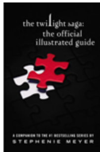
The Twilight Saga: The Official Illustrated Guide